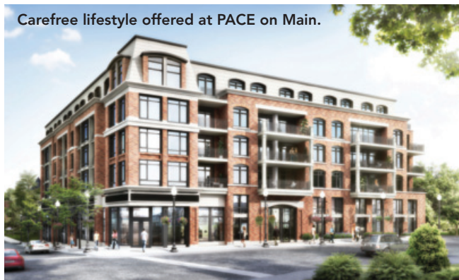
Carefree lifestyle offered at PACE on Main.

selection still remains ranging from one- to three-bedroom suites in sizes from 650 to 1,368 square feet. Classic interiors feature Geranium's quality finishes with nine-foot ceilings, engineered hardwood flooring, granite countertops, stainless steel kitchen appliances, walk-in closets and spa-inspired bathrooms. Prices start at $339,900 including an underground parking space.