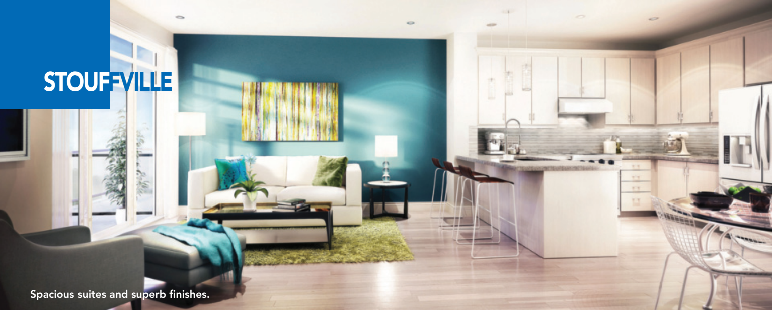
Spacious suites and superb finishes.